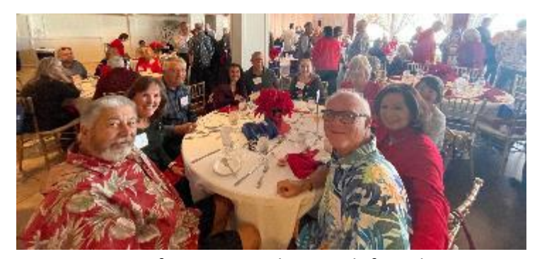
Lots of time to catch up with friends