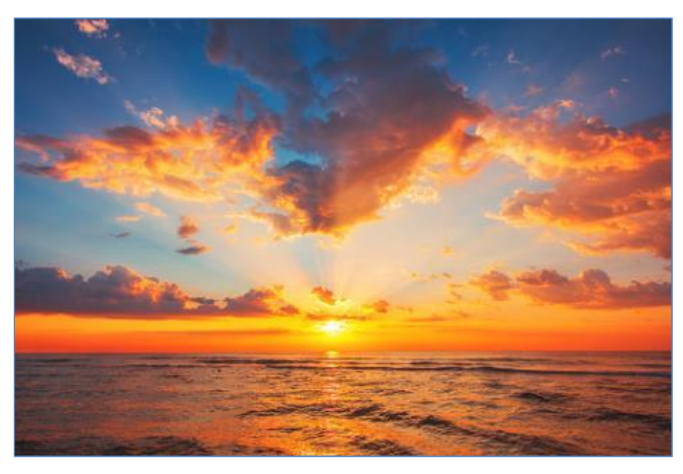
There are some who bring a light so great to the world that even after they have gone the light remains