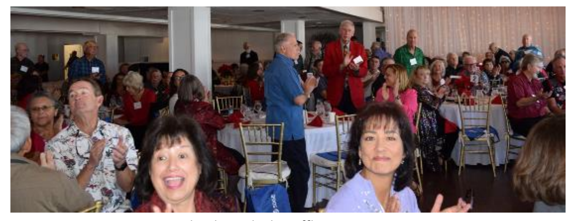
Applauding a lucky raffle recipient